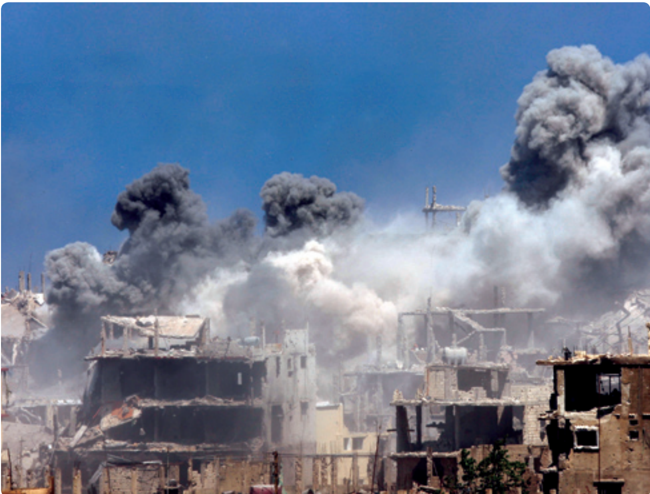
Smoke billows from the besieged Palestinian refugee camp of Nahr al-Bared in July 2007 following fighting between Lebanese government troops and Fatah al-Islam militants