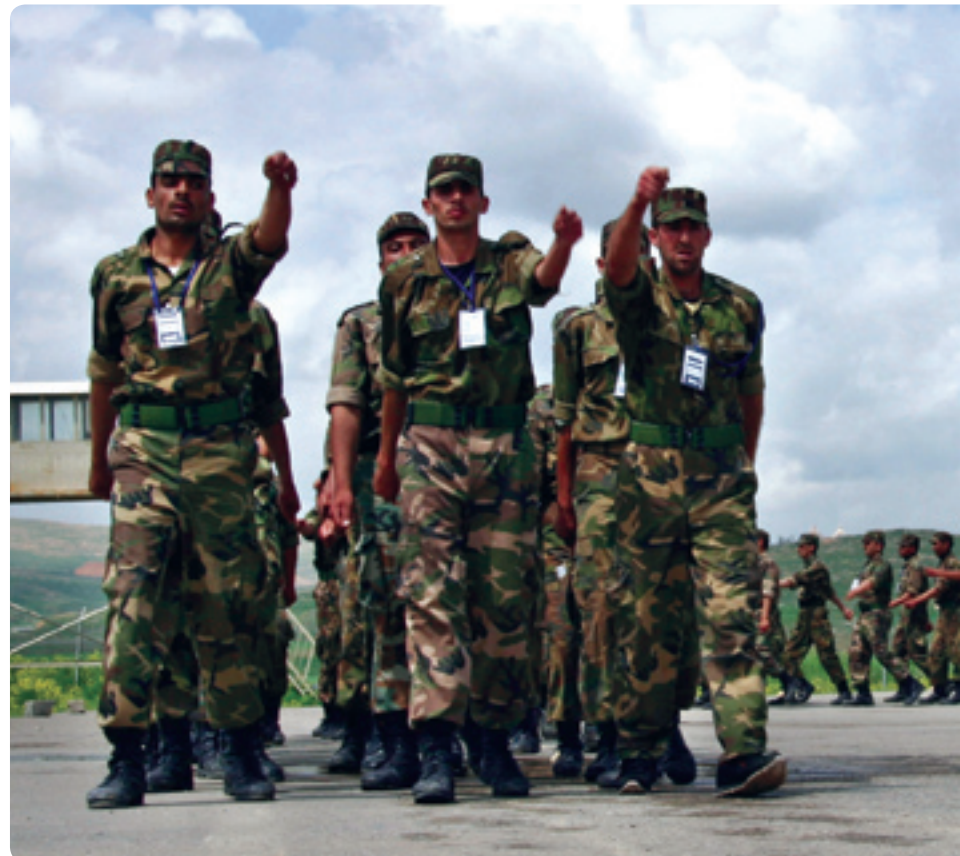
Iraqi police recruits train at a military camp in the northern Kurdish city of Sulaymaniyah, April 2007

One fundamental cause for the current situation inside Iraq is the failure of the politicians to deliver on both