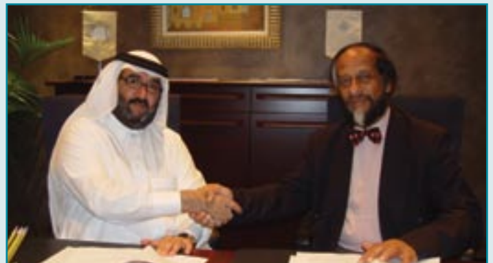
Dr. R.K. Pachauri

The first phase of the joint research would seek to identify the