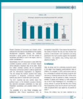
Extensive statistics and charts on GCC armed forces, inflation growth, oil production, and trade between the GCC and Asia.

The Gulf Yearbook 2008-2009 is the sixth in the annual Yearbook series published by the Gulf Research Center focusing on the key political, economic, social and strategic challenges that define developments in the Gulf region. As in the past years, the Yearbook offers a combination of overviews of major events and in-depth analysis of key issues to facilitate better understanding of the challenges faced by the region. The first section covers political developments such as parliamentary elections in Kuwait and the political role of women in the GCC. In the section on foreign relations, the papers cover a spectrum of issues relating to the GCC's relations with the US, Europe, Asia, Africa and Turkey. Defense and security issues – including efforts to establish a regional security system – are examined in section three, while section four provides an overview of the economic developments in the region, including in the energy and telecom sectors. Educational reform and water policies in the region are examined in section five pertaining to social issues in the Gulf region. The final section on Iraq, Iran and Yemen provides an insight into developments in these three important countries of the region.