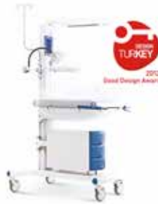
BABYREST - M100 INFANT WARMER