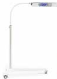
BABY LED FORCE LED PHOTOTHERAPY SYSTEM