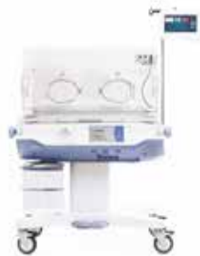
MAGIC LOGGIA BABY INCUBATOR