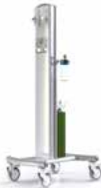
INFANT INTENSIVE CARE MODULE