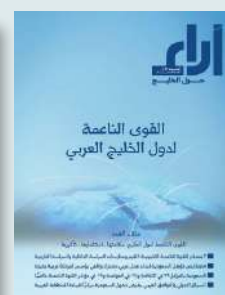
#188 (August 2023): The Soft Powers of the Gulf States: Their Potential - Their Investment - Their Impact