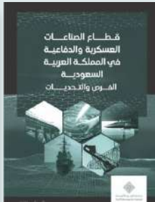
Defense in the Kingdom of Saudi Arabia: Opportunities and Challenges Facing the Sector Gulf Research Center