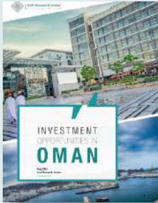
Investment Opportunities in Oman Gulf Research Center