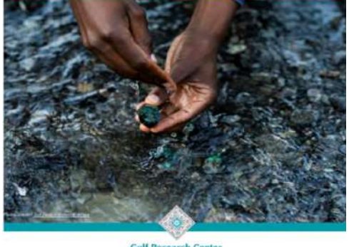
Gulf Research Center The Governance of Natural Resources in Africa and the Role of the Gulf States