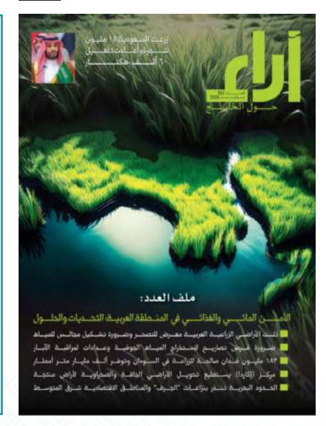
#201 (August 2024)

ASEAN & GCC Countries Relations September 2024