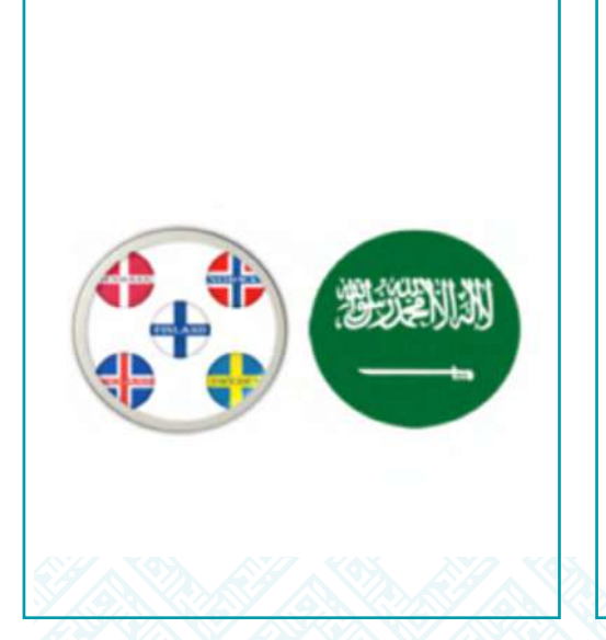
Nordic Countries & Saudi Arabia Relations

ASEAN & GCC Countries Relations September 2024