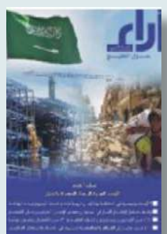
# 186 (June 2023): Current Arab Crises: Dilemma and Solutions