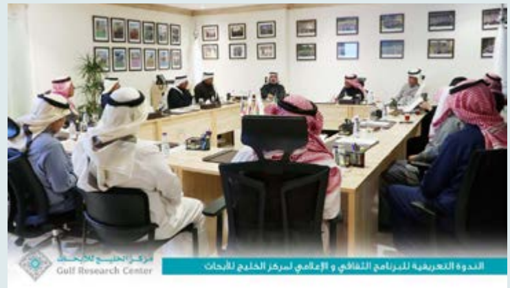
GRC Cultural and Media Program Symposium, Riyadh