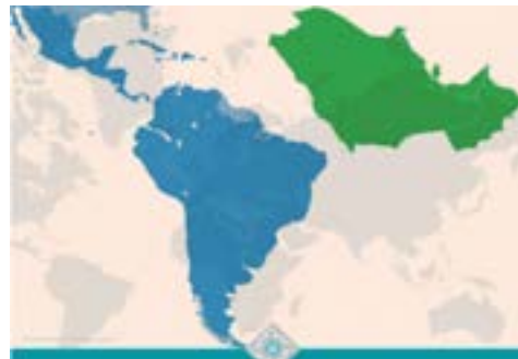
GCC-Latin America Trade and Investment Relations