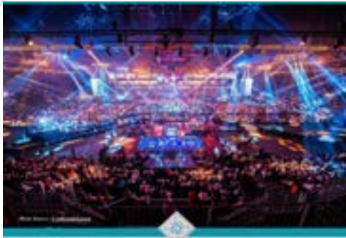
Beyond the Gloves: Developments in Saudi Arabia's Boxing Sector