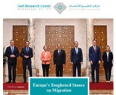
Europe's Toughened Stance on Migration