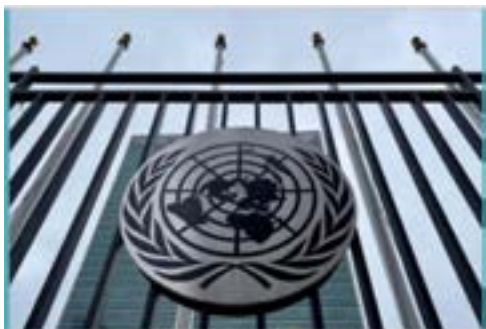
Reforming the United Nations: A GCC Perspective