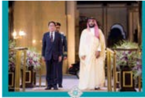
Scope and Facets of Japan-Saudi Arabia Relations