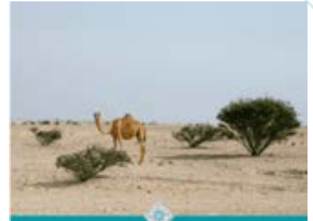
GCC States' Initial Steps to Combat Desertification