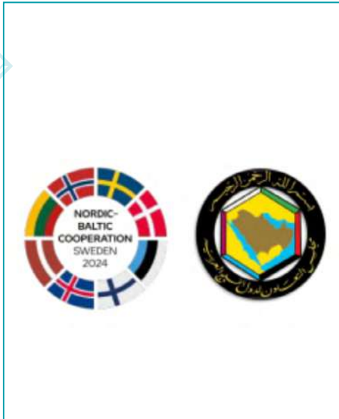
NB8 & GCC Countries Relations September 2024