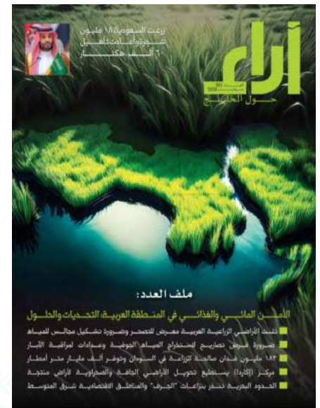
#201 (August 2024) Water and Food Security in the Arab Region: Challenges and Sustainable Solutions