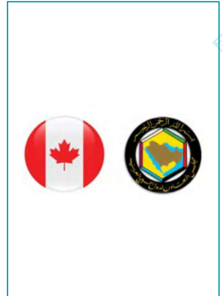
Canada & GCC Countries Relations September 2024