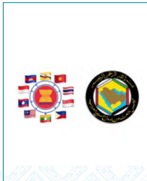
ASEAN & GCC Countries Relations September 2024