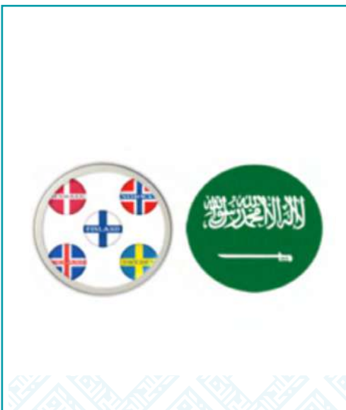
Nordic Countries & Saudi Arabia Relations September 2024