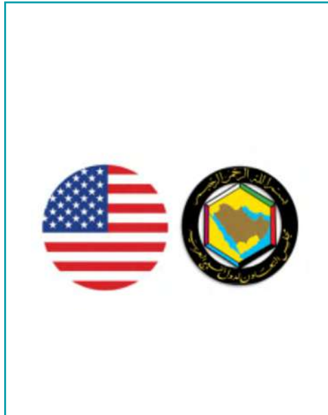
United States & GCC Countries Relations September 2024